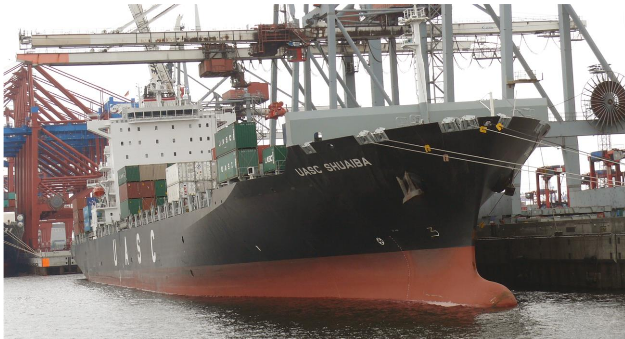
Hamburg 7/2010

2015: Renamed CPO SAVANNAH (UASC charter expired).