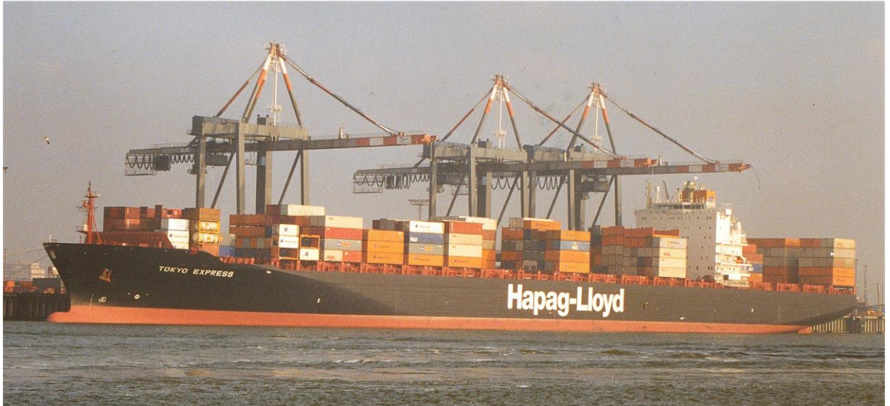
Bremerhaven 14/10/2000