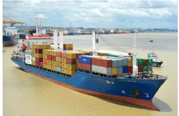
above: the 'UCC 14' vessel DA JI, originally the WATERSTOKER, upon departure from Chittagong. The type name reflected the ships' deadweight capacity of around 14,000 dwt.

The SAI SUNRISE was originally built as the WATERGIDS for Dutch owner and liner operator Joon Shipping, which operated several ships of this type on transatlantic services. After the company went bankrupt in 1991, the WATERGIDS and her sister vessels in the Joon fleet were