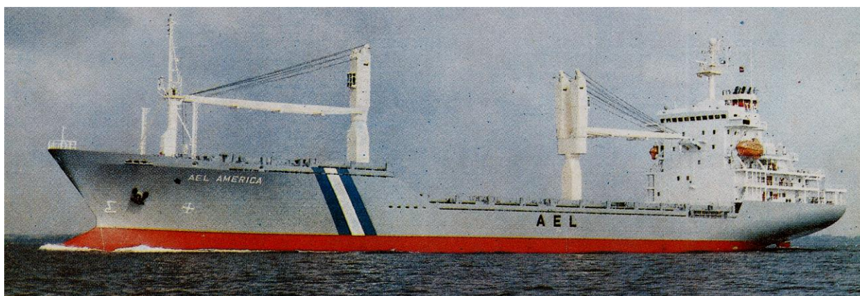
Named AEL AMERICA (charter name)