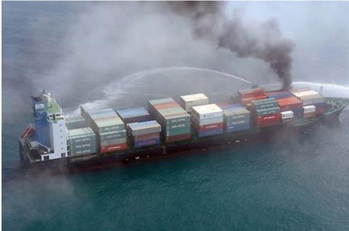
SIMA SAMAN after collision with tanker KASHMIR off Jebel Ali 12th February, 2009