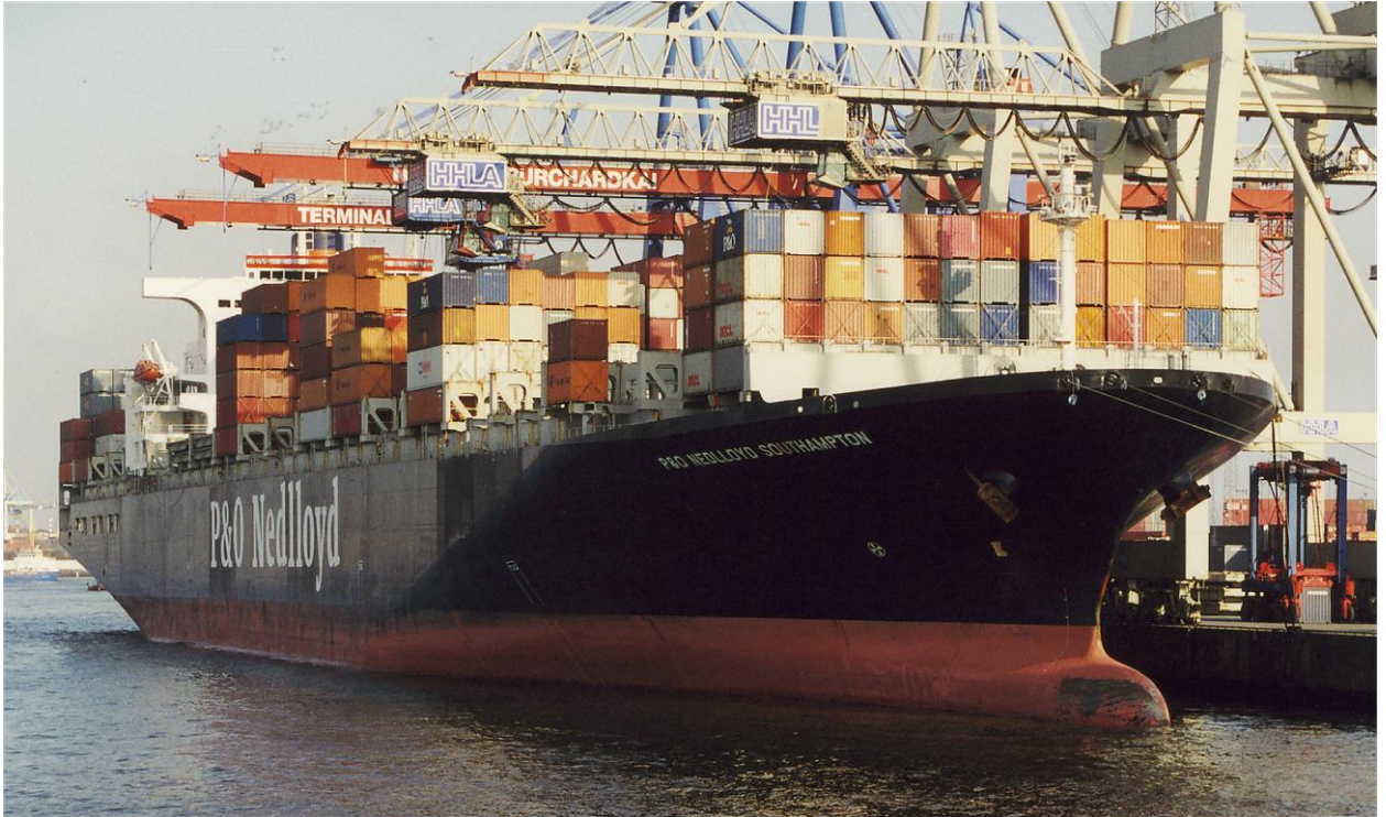
Hamburg 1/9/1998

2005: To Blue Star Shipmanagement BV, Netherlands (P&O Nedlloyd subsidiary).