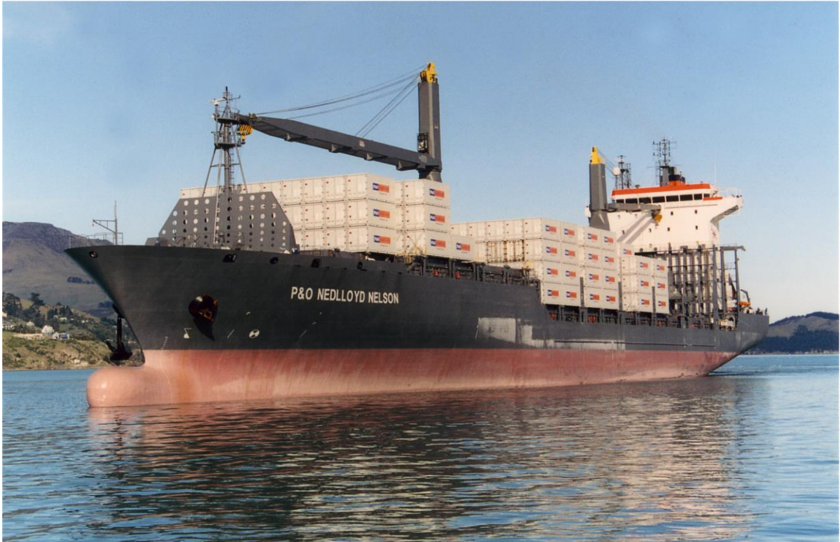
Lyttelton (N.Z.) 5/7/2002

2017: Sold to OKEE Maritime GmbH, Germany. Renamed OKEE ALBA (cranes have been removed).