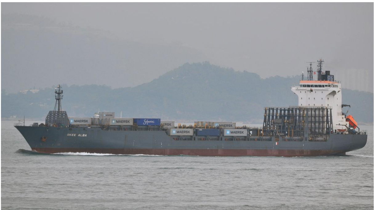
Named OKEE ALBA Hong Kong 13/11/2017

2017: Sold to OKEE Maritime GmbH, Germany. Renamed OKEE ALBA (cranes have been removed).