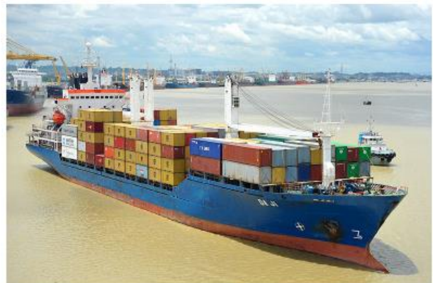
above: the 'UCC 14' vessel DA JI, originally the WATERSTOKER, upon departure from Chittagong. The type name reflected the ships' deadweight capacity of around 14,000 dwt.

The SAI SUNRISE was originally built as the WATERGIDS for Dutch owner and liner operator Joon Shipping, which operated several ships of this type on transatlantic services. After the company went bankrupt in 1991, the WATERGIDS and her sister vessels in the Joon fleet were