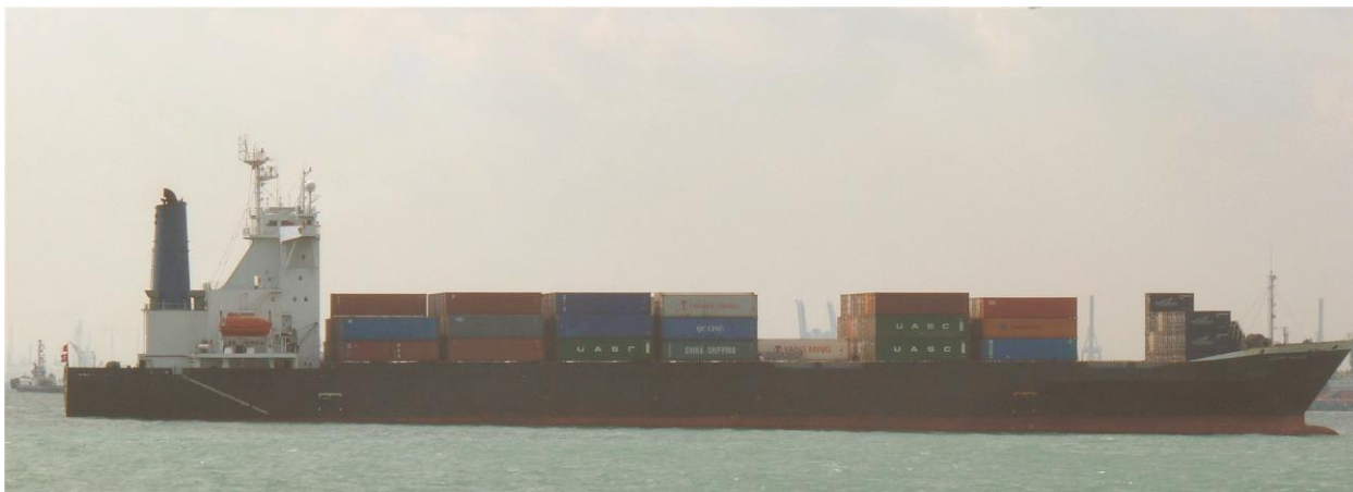
Singapore 3/2/2010