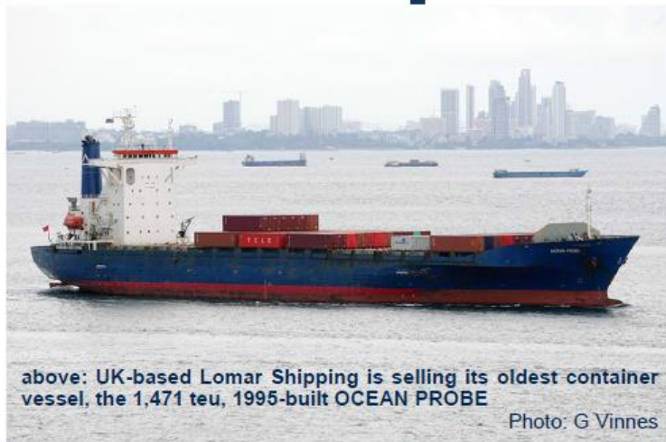
above: UK-based Lomar Shipping is selling its oldest container vessel, the 1,471 teu, 1995-built OCEAN PROBE

The sale price is believed to be in the region of USD 4 M. The vessel is currently deployed in Asia, performing a charter for Bengal Tiger Line (BTL).