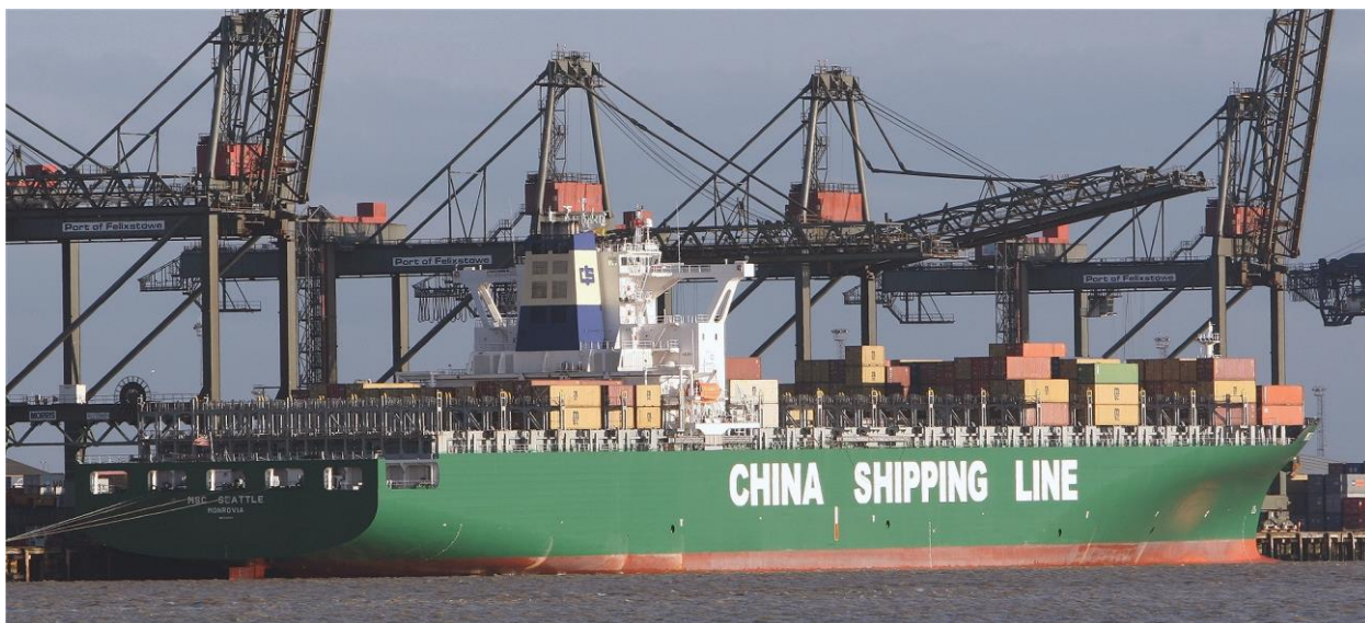
CSCL sublet to MSC from 2008-2010 Felixstowe (UK) 27/11/2008