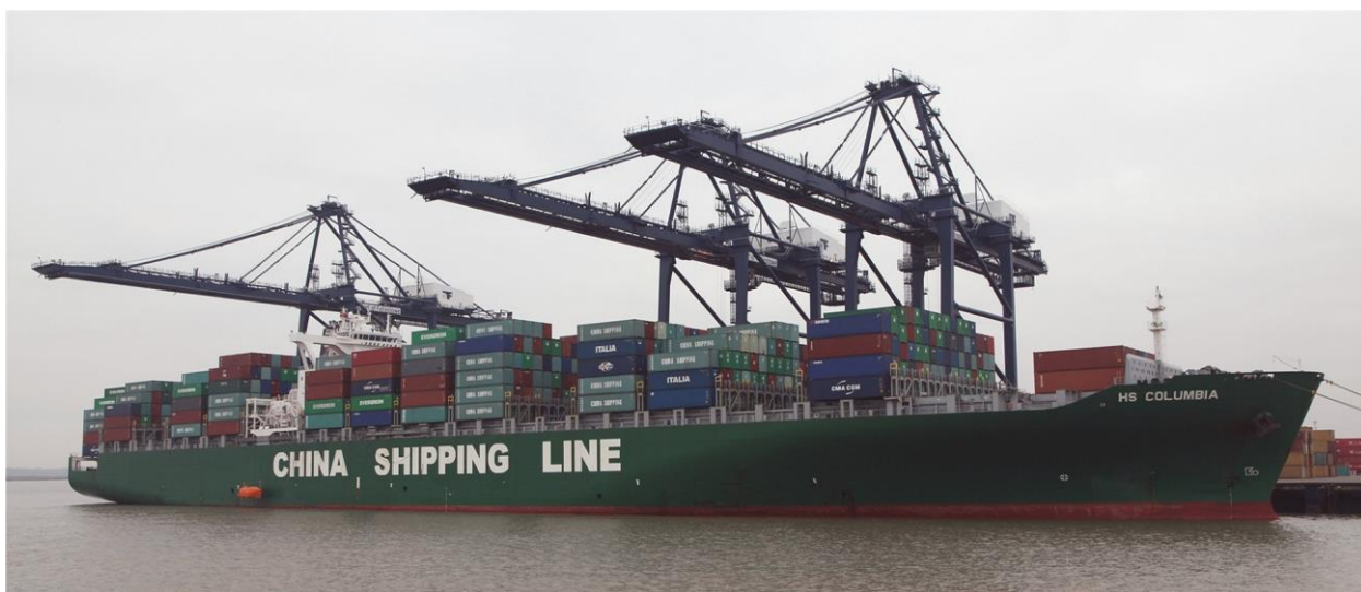
Named HS COLUMBIA Felixstowe (UK) 10/12/2010

2017: Demolition as HS COLUMBIA-1 (Togo-flag) at Chittagong 21/02/2017.