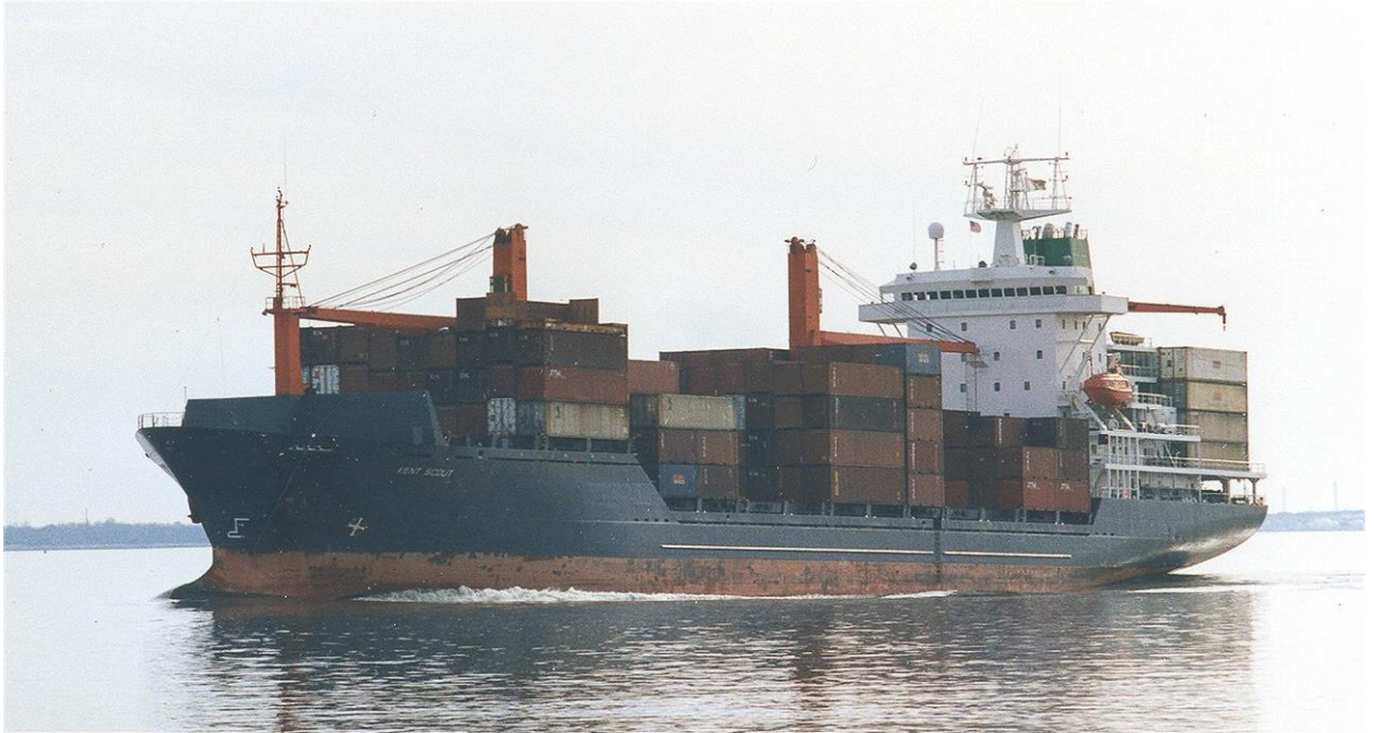
Delaware River 2/2/1998

1997: Renamed KENT SCOUT (charter name).