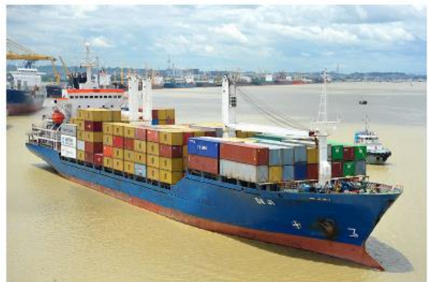
above: the 'UCC 14' vessel DA JI, originally the WATERSTOKER, upon departure from Chittagong. The type name reflected the ships' deadweight capacity of around 14,000 dwt.

The SAI SUNRISE was originally built as the WATERGIDS for Dutch owner and liner operator Joon Shipping, which operated several ships of this type on transatlantic services. After the company went bankrupt in 1991, the WATERGIDS and her sister vessels in the Joon fleet were