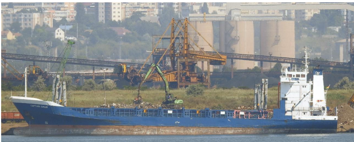
Named CAPTAIN OMAR (Ruad Marine Services Srl, Romania / Syria) Constanta 3/7/2016