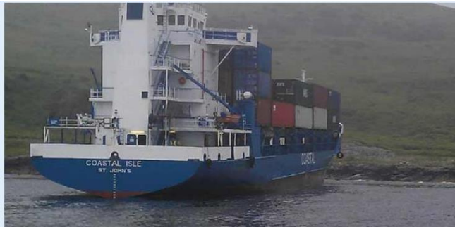
Coastal Isle aground

(www.tradewindsnews.com - July 3rd, 2012)