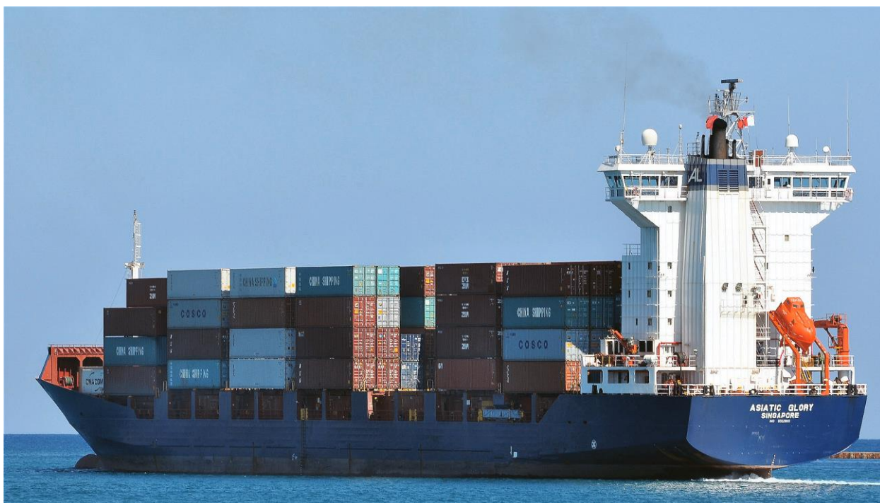
Named ASIATIC GLORY Malta Freeport 21/06/2017

2019: Reported sale to OEL - Orient Express Lines (Singapore) Pte Ltd. Enbloc sale of two Sedef-built 1,134 teu sister vessels.