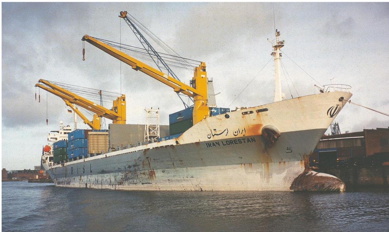
Hamburg 2001

2008: Renamed OCEAN CANDLE (intra-Iranian name change).