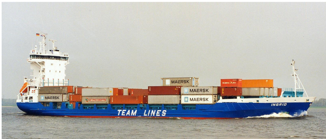
Elbe River 28/4/2000

2006/07: Sold to JR Shipping (Shipmanagement) BV, Netherlands. Renamed ELECTRON.