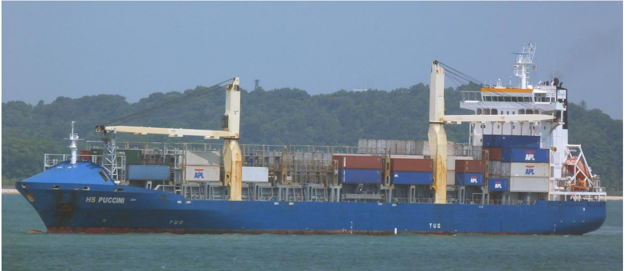
Singapore 05/07/2011