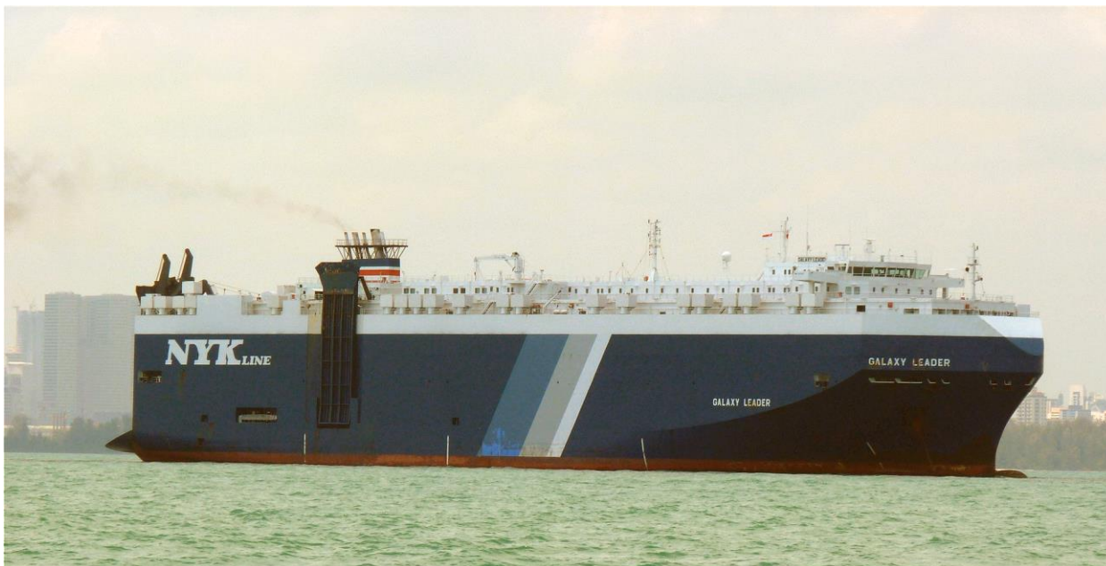
Singapore 3/2/2010