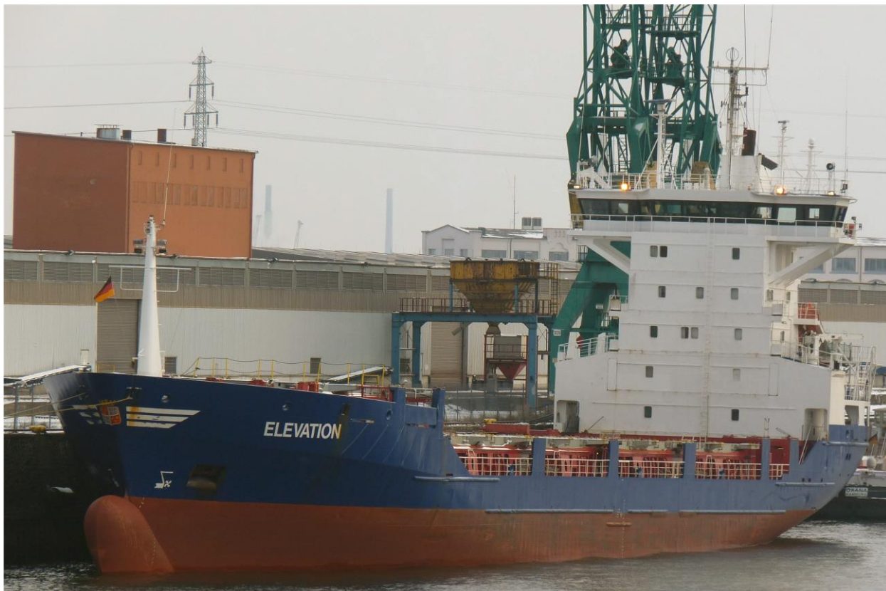
Hamburg 4/1/2010