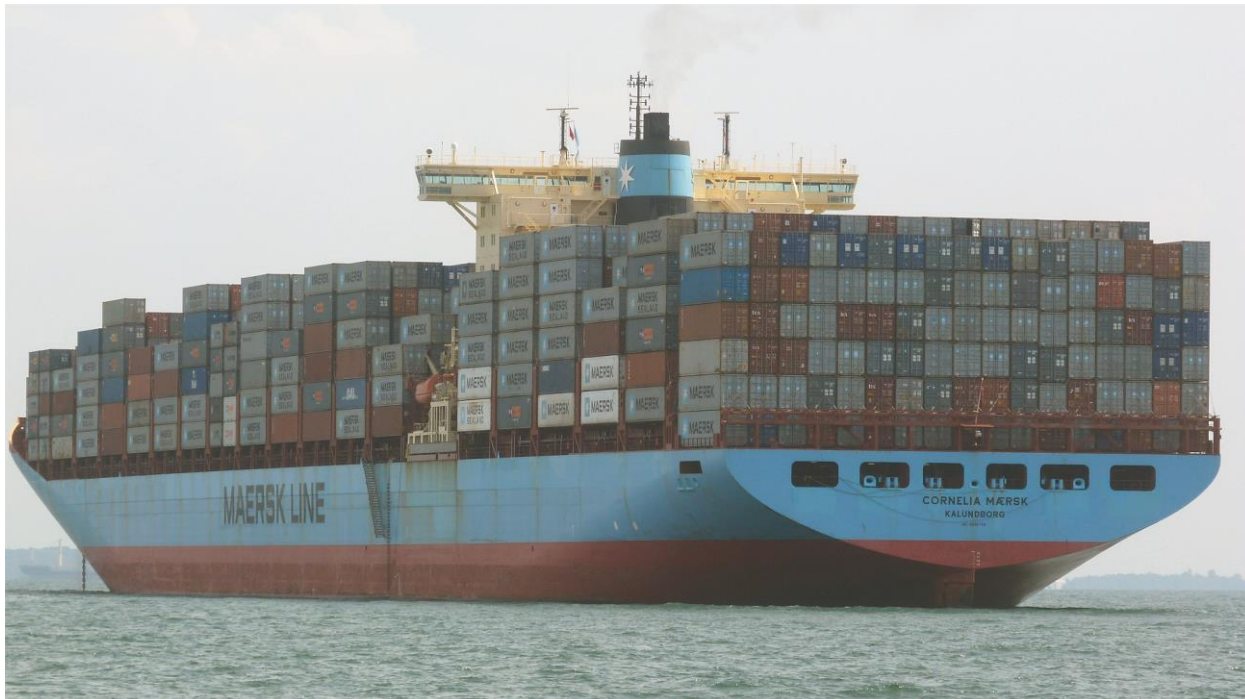
Singapore 22/6/2011

2023: Sold to Technomar Shipping (Greece).