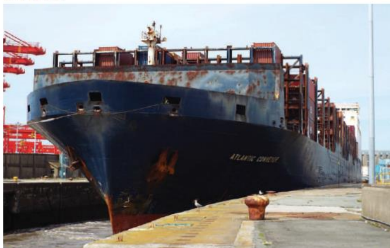
ATLANTIC CONVEYOR in the Gladstone entrance

Here are two of my photos of the final old G3 ACL vessel ATLANTIC CONVEYOR departing from Liverpool on 13th August at 2.30 p.m. When she passed New Brighton she blew five long blasts from her siren, sadly no replies from any of the tugs that were around in the river at the time. She was off to finally discharge at Antwerp and Hamburg, then she would sail via the Cape of Good Hope to Alang for breaking.