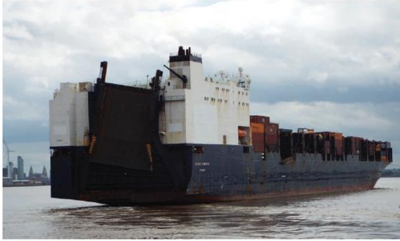
ATLANTIC CONVEYOR turning to starboard to depart. Note the white patches over the logos. D. Crolley

All five G3 class have now sailed to the beach in Alang and an era in the ACL history has closed. I wonder if the new Chinese built G4 ships will give ACL as good a service as these vessels have.