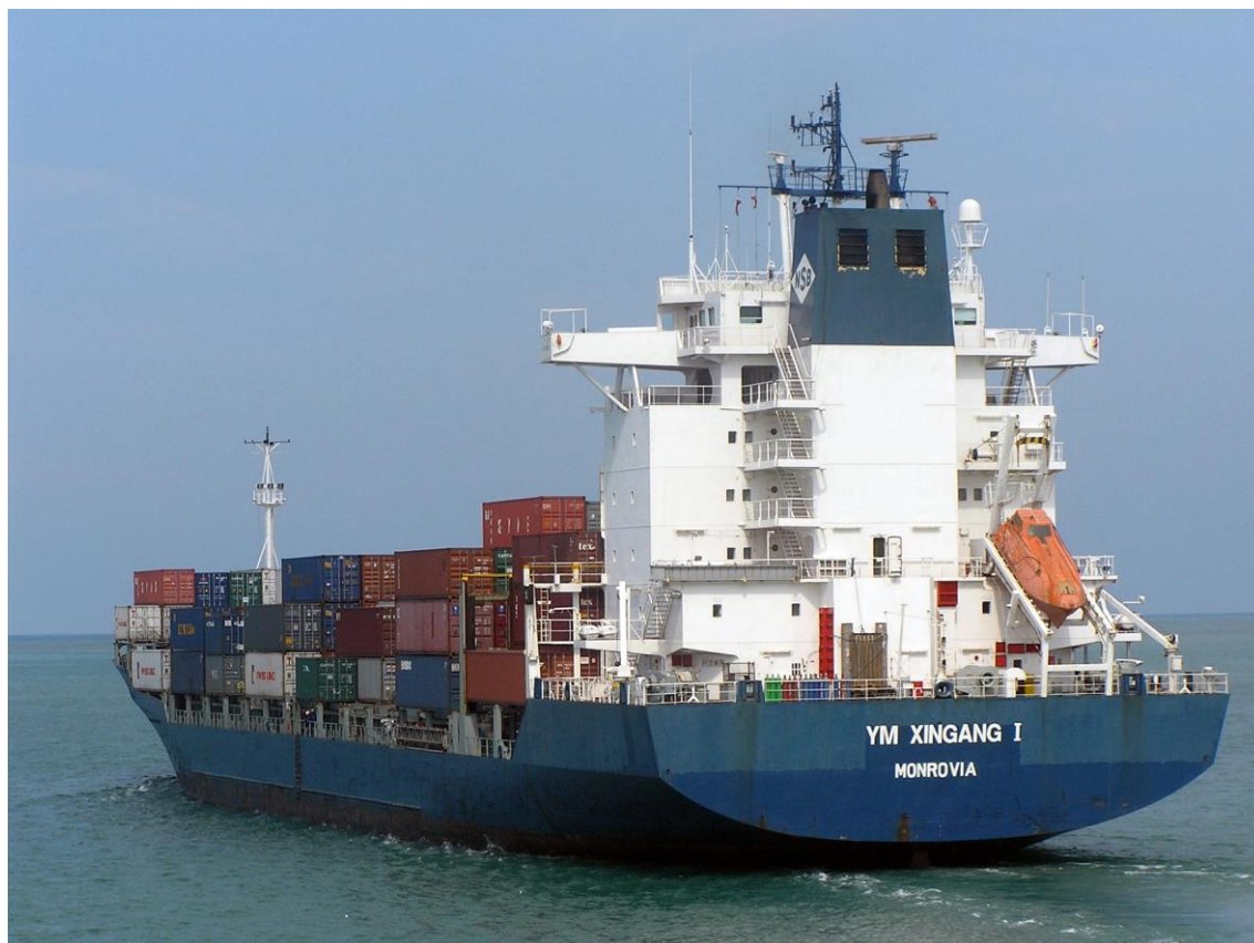
Surabaya 6/12/2006