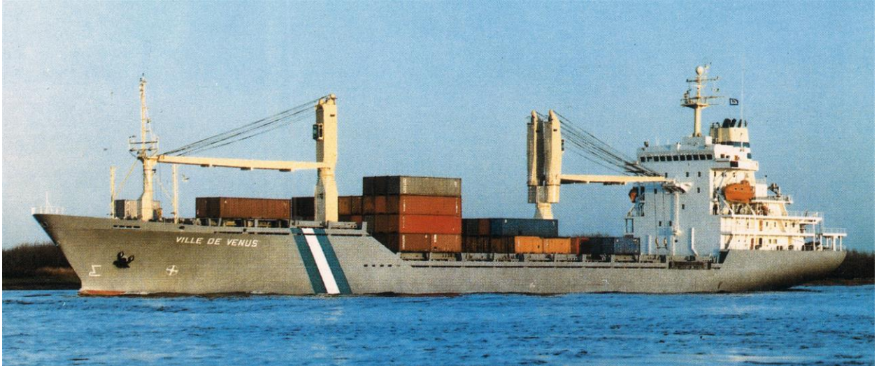
Named VILLE DE VENUS (charter name)