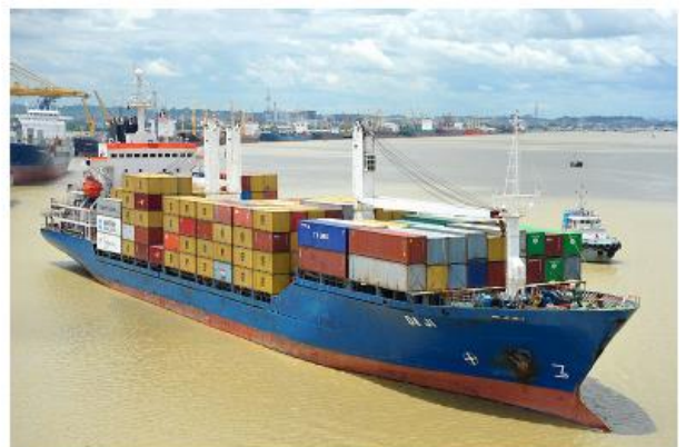
above: the 'UCC 14' vessel DA JI, originally the WATERSTOKER, upon departure from Chittagong. The type name reflected the ships' deadweight capacity of around 14,000 dwt.

The SAI SUNRISE was originally built as the WATERGIDS for Dutch owner and liner operator Joon Shipping, which operated several ships of this type on transatlantic services. After the company went bankrupt in 1991, the WATERGIDS and her sister vessels in the Joon fleet were