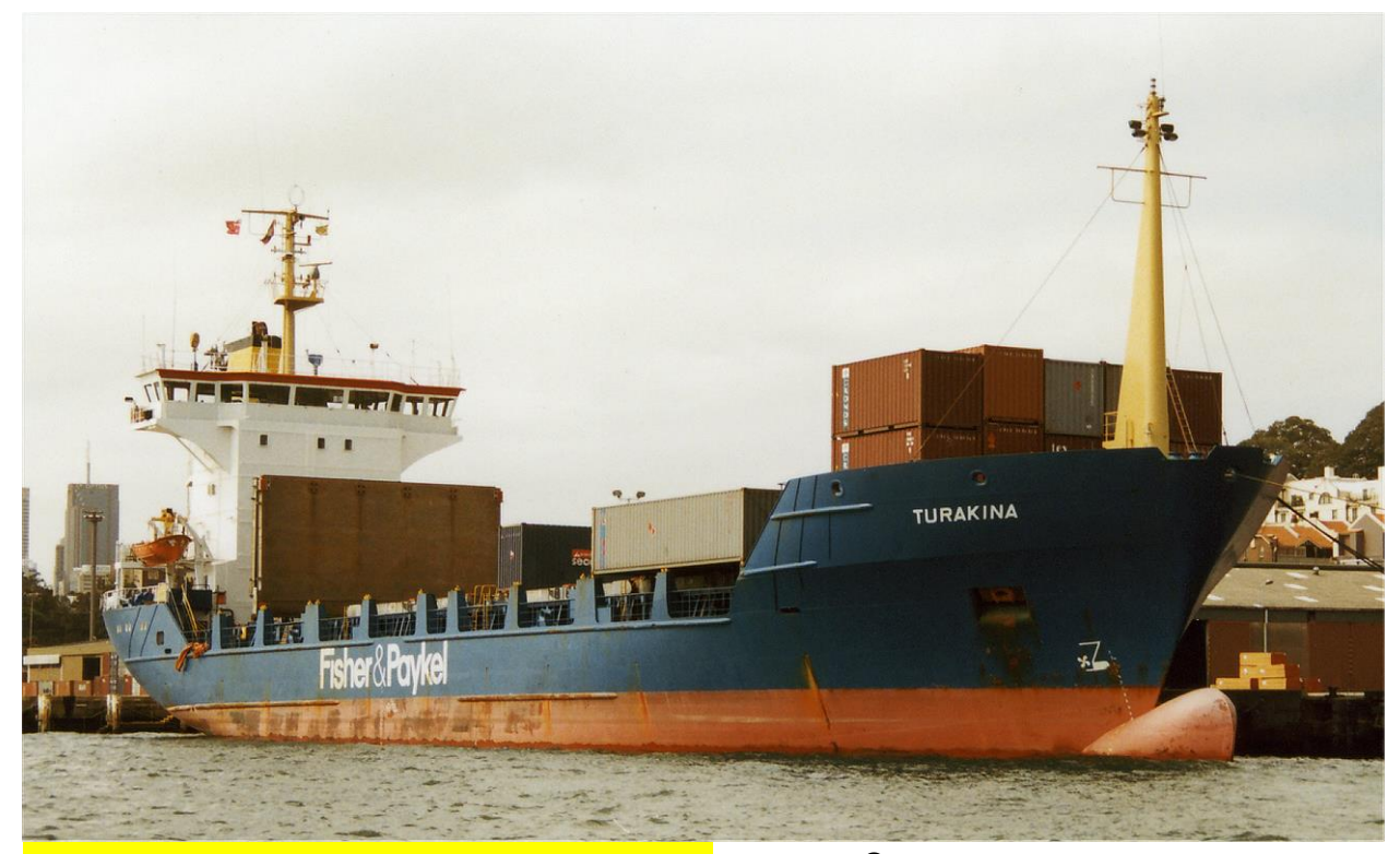
Under arrest at Sydney (receivership of South Pacific Shipping Ltd) 23/2/1998

1998: Sold via auction. Renamed ATENS. 2000: Renamed IBERICA EXPRESS. 2000: To Exmaris, Morocco. Renamed CASABLANCA EXPRESS. 2011: To BIA Shipping Co, Romania. Renamed DUDU EXPRESS. 2012: To El Reedy Shipping Agency, Egypt. 2014: Renamed MERO STAR. 2020-08: Sustained hull damage and took water caused by chemical explosion whilst moored at Beirut Port on 04/08/2020. 2020-11: Demolition at Aliaga, 21/11/2020.