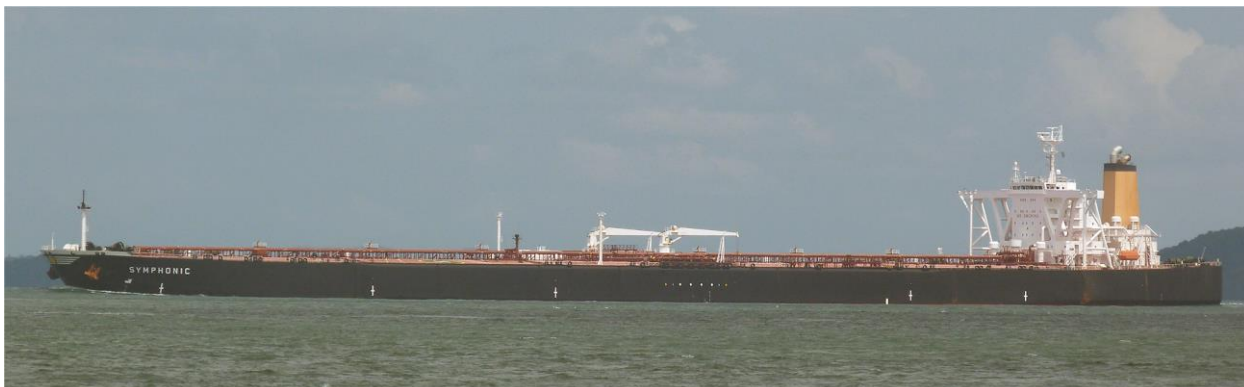
Malacca Straits (Singapore) 29/6/2011