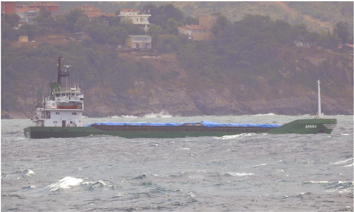
Named AMIRA Istanbul / Bosphorus Anchorage - Black Sea 5/7/2016