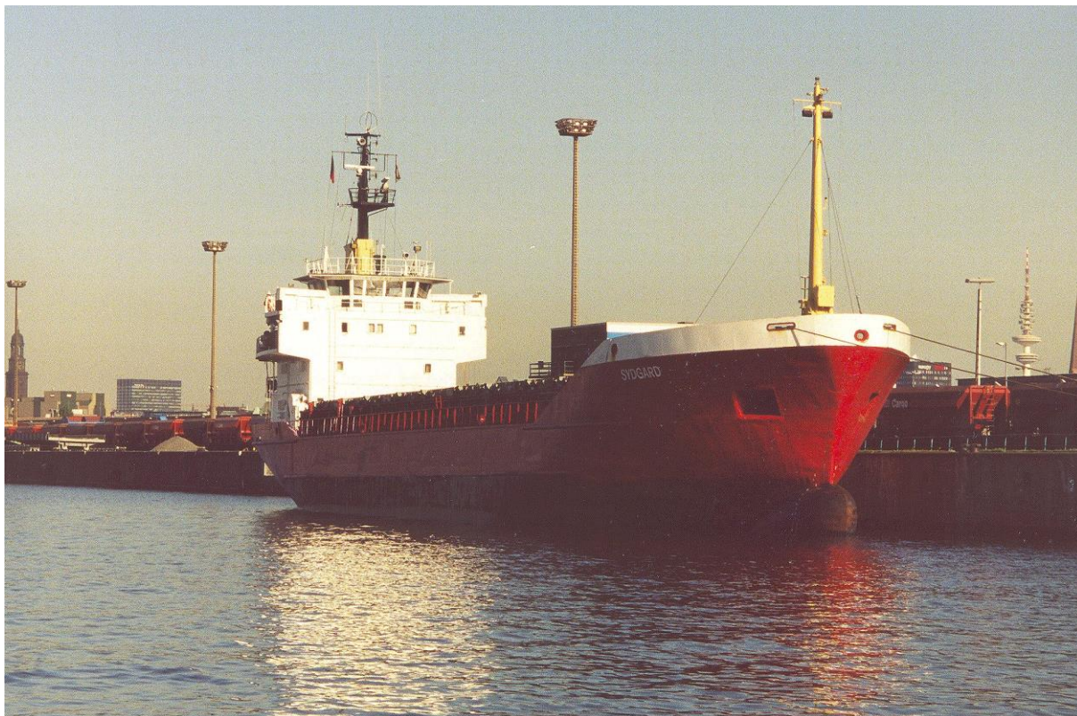
Hamburg 2001