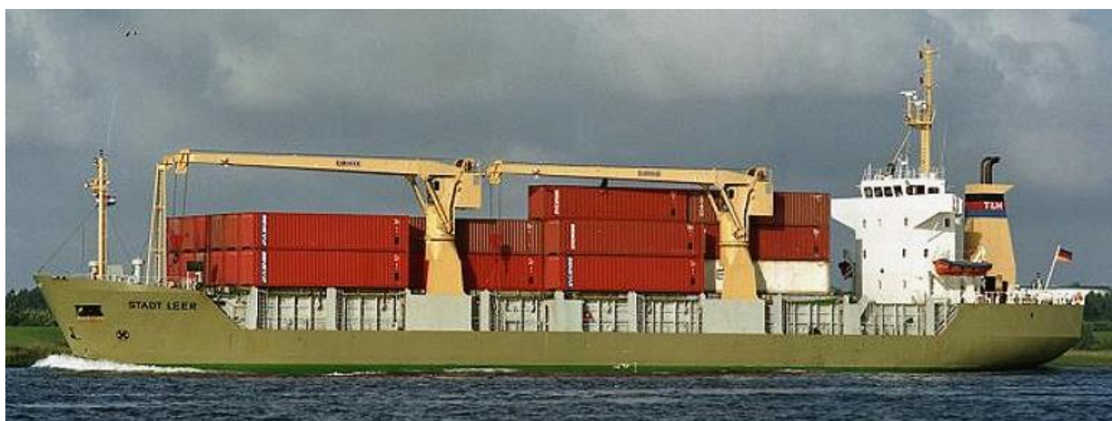
Named STADT LEER 13/8/1998

( https://www.wssrotterdam.nl/nieuwsbrief/nb197.pdf )