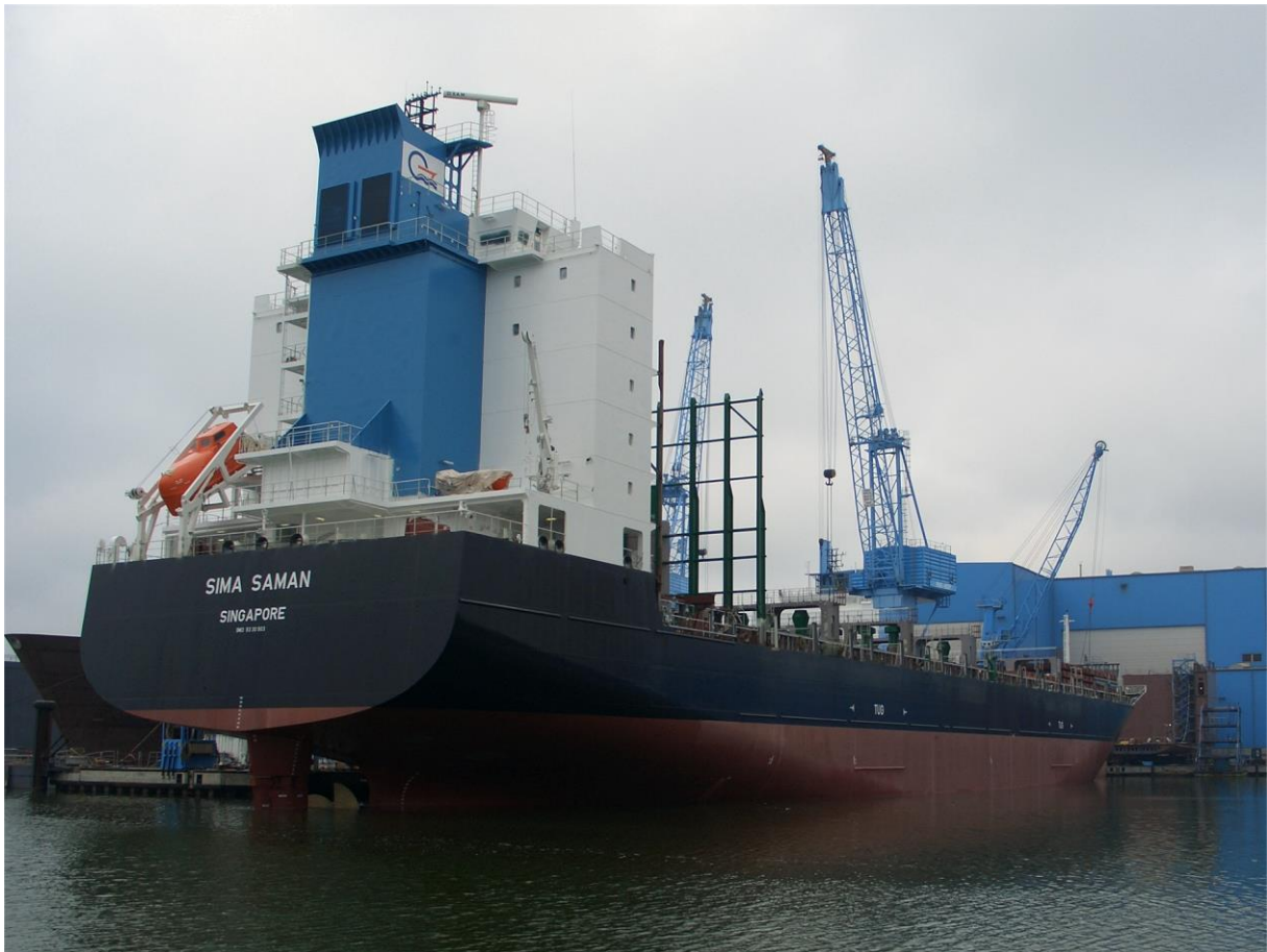
2006: At Wolgast - Peene-Werft GmbH during fitting-out 26/8/2006