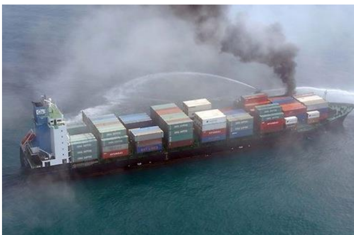
SIMA SAMAN after collison with tanker KASHMIR off Jebel Ali 12th February, 2009

2009: The 1988-built, 45,003 dwt chemical tanker KASHMIR collided in restricted visibility with the 2006-built, 1,440 teu containership SIMA SAMAN at approximately 9.40 a.m. on Tuesday in a busy shipping channel between five to eight miles off the port Jebel Ali. ... a fire broke out on both ships as a result of the collision which led to two of the 22 tanks of the tanker being ruptured. The KASHMIR was reported to have been carrying 30,000 tonnes of oil condensates. By the evening of yesterday the fire was controlled and extinguished and both ships anchored in safe waters off the port. There were no casualties reported however two crew members of the SIMA SAMAN lifted out of the water and are reported to have suffered slight injuries. No pollution has so far been reported although it appears that the KASHMIR may have lost some of its cargo. (http://www.timesofmalta.com/articles/view/20090212/local/mma-investigates-collision-of-maltese-ship-off-jebel-ali - 12th February 2009)