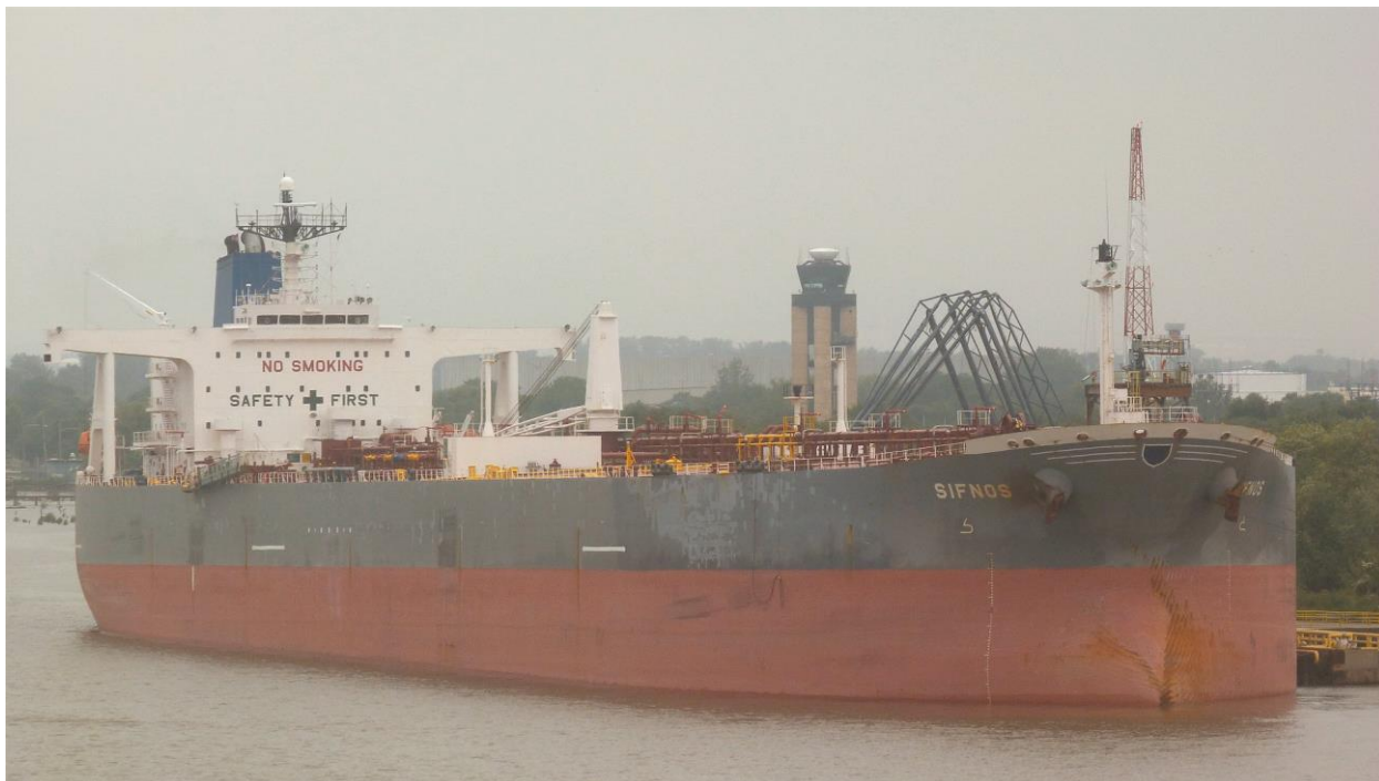
Delaware River 11/9/2011

2017: Sold to International Andromeda Shipping, Monaco. Renamed WHITE TRADER.