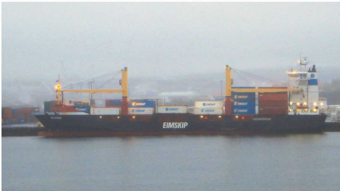
Reykjavik 17/6/2015 © E. Klement