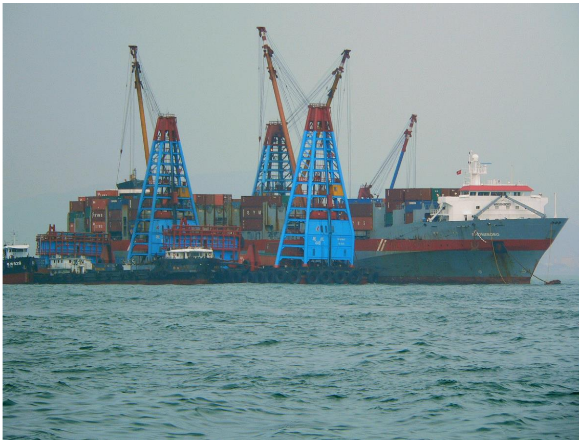
Hong Kong 8/9/2005