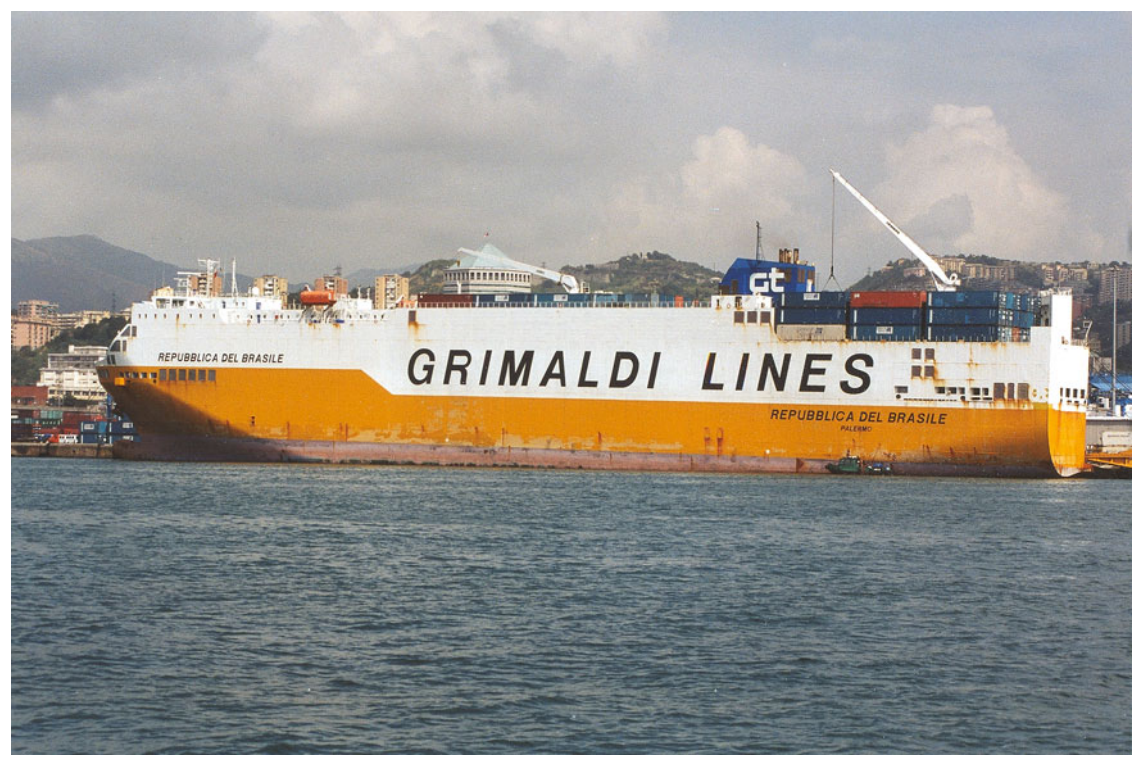
Genoa 6/8/2001