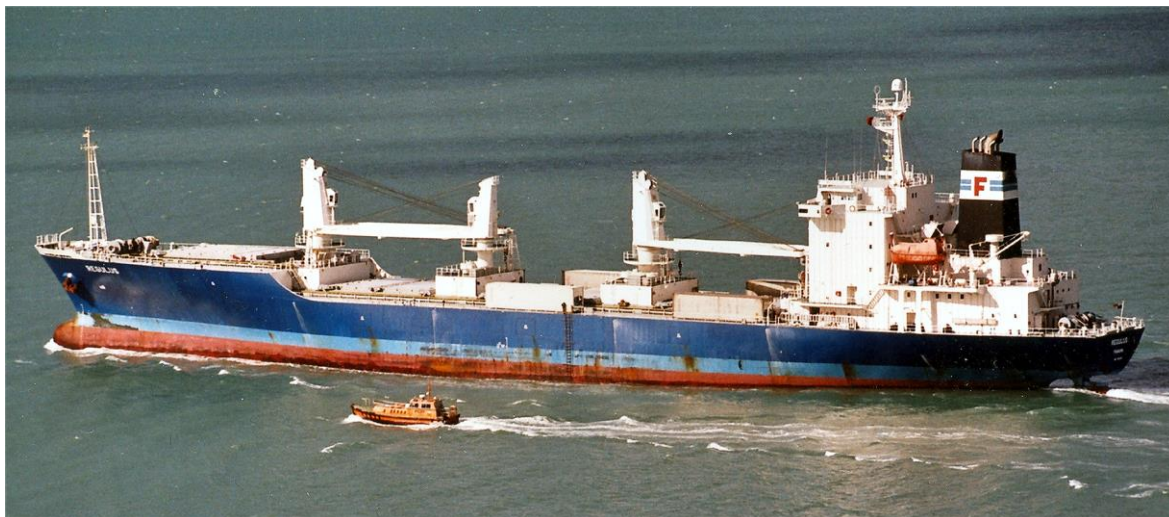
Lyttelton (N.Z.) 14/4/2007