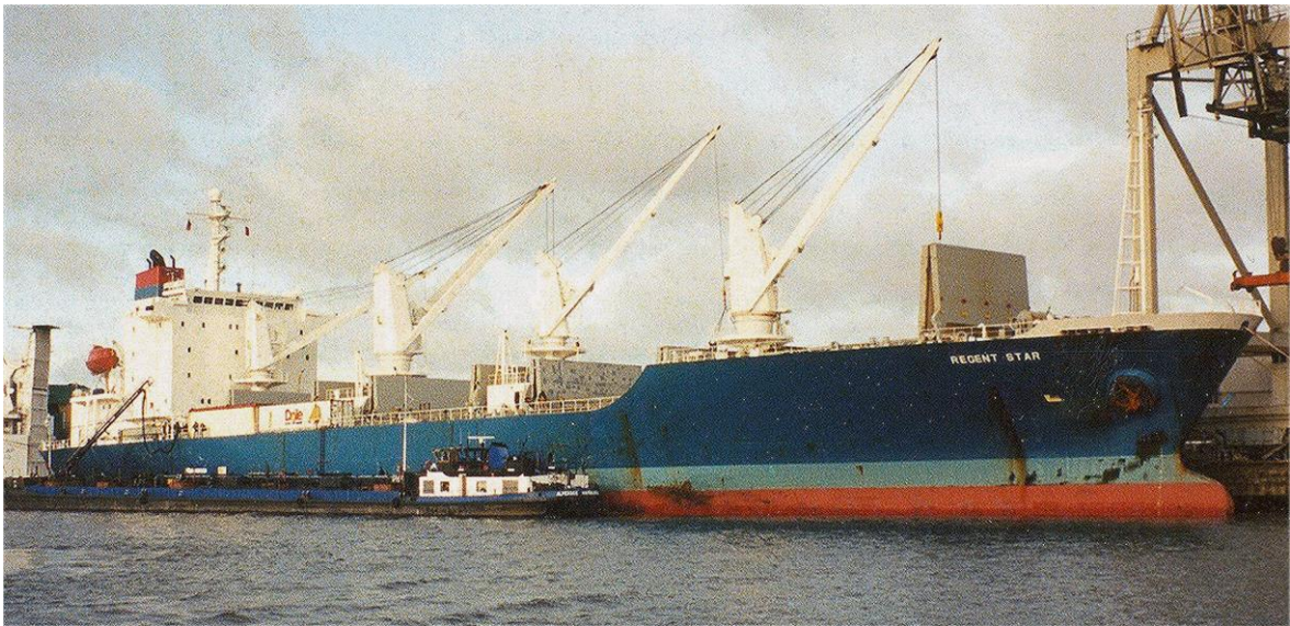
Named REGENT STAR Hamburg 2001