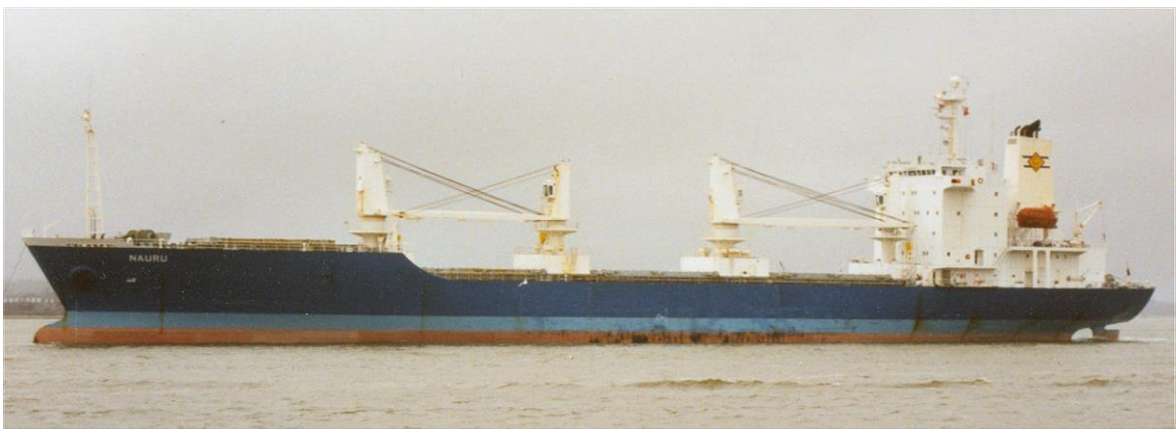
Named NAURU Southampton 7/1/1998