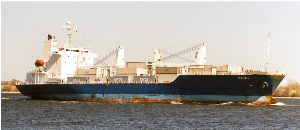
Named NAURU Delaware River 13/4/1999