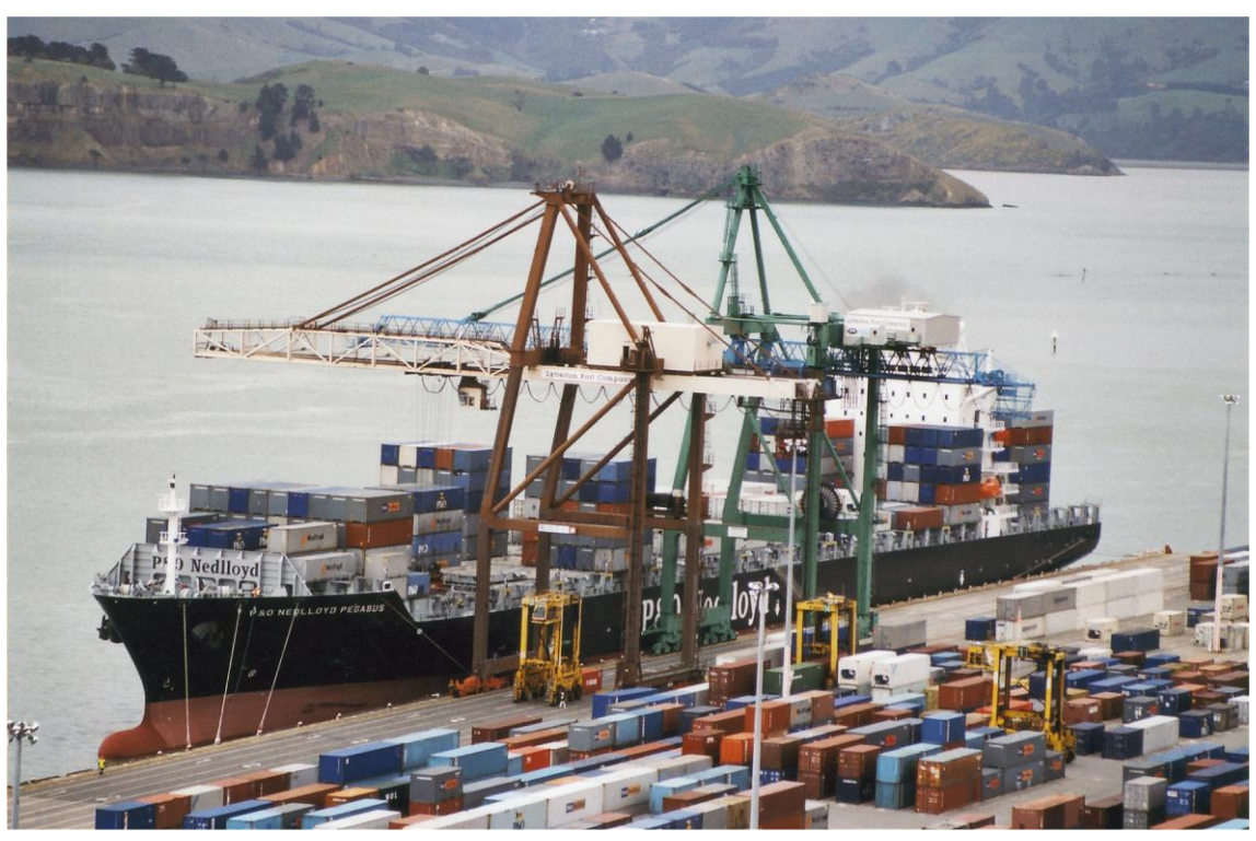
Lyttelton (N.Z.) 16/11/2002

Samsung Heavy Industries Co. Ltd. Geoje (South Korea) 1360