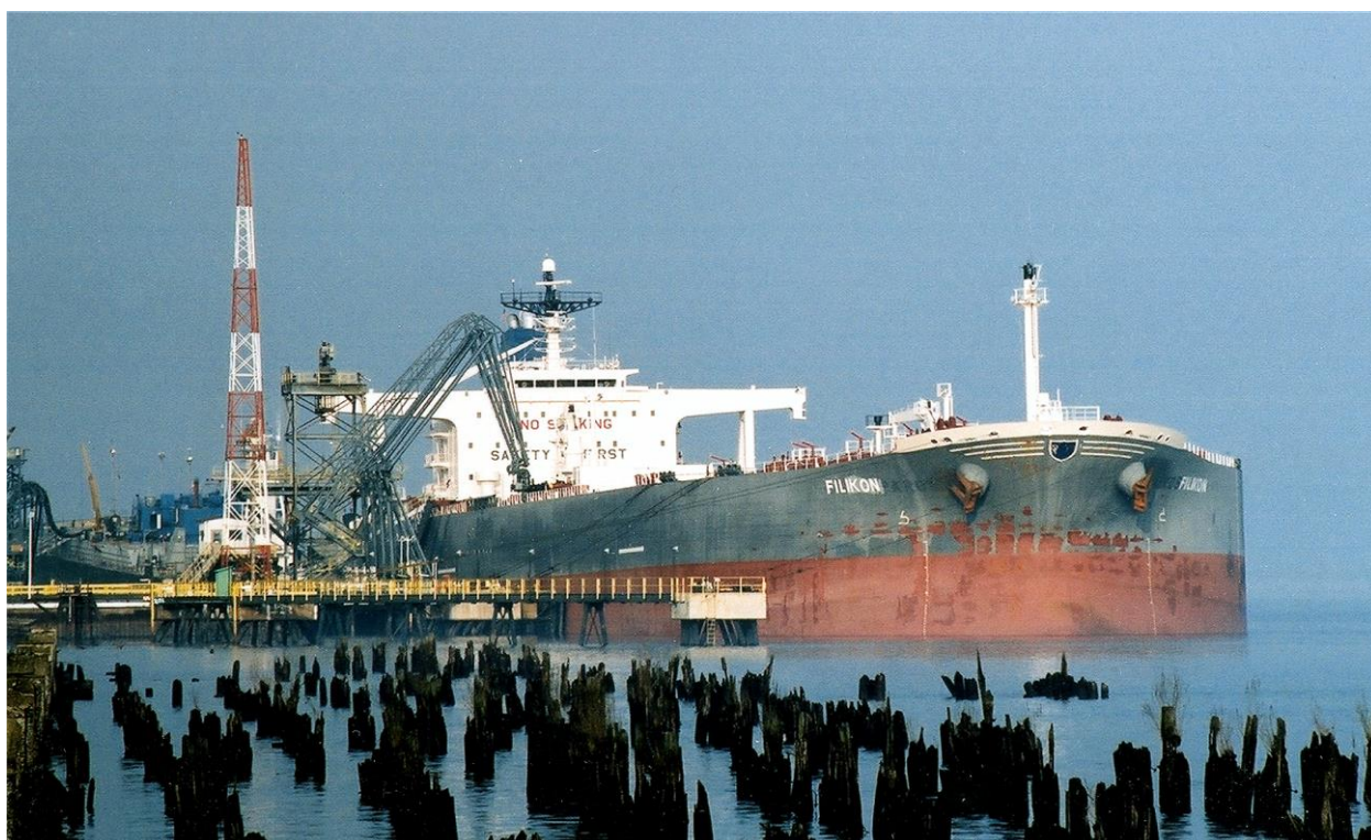
Named FILIKON Delaware River 3/9/2004

2003-12: Sold to Ceres Hellenic Shipping, Greece. Renamed FILIKON.