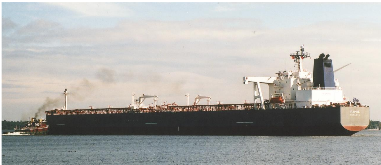
Delaware River 12/10/2003

2003-12: Sold to Ceres Hellenic Shipping, Greece. Renamed FILIKON.