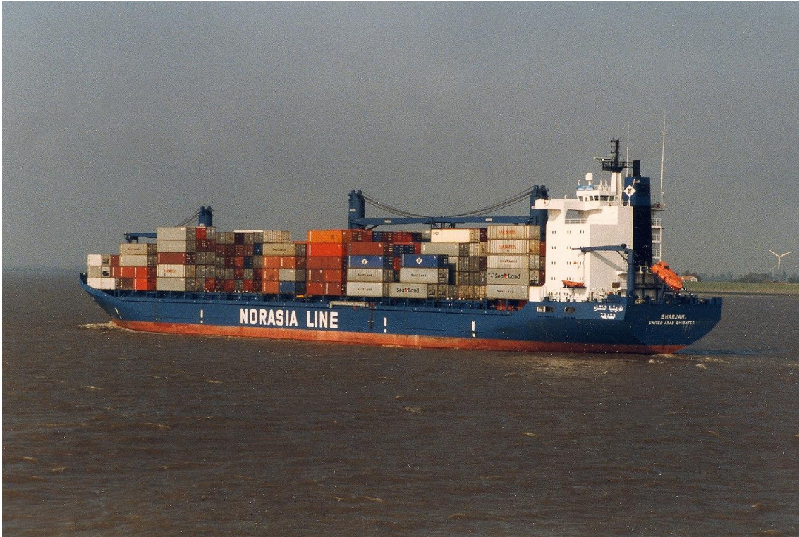
River Elbe 1/10/1993