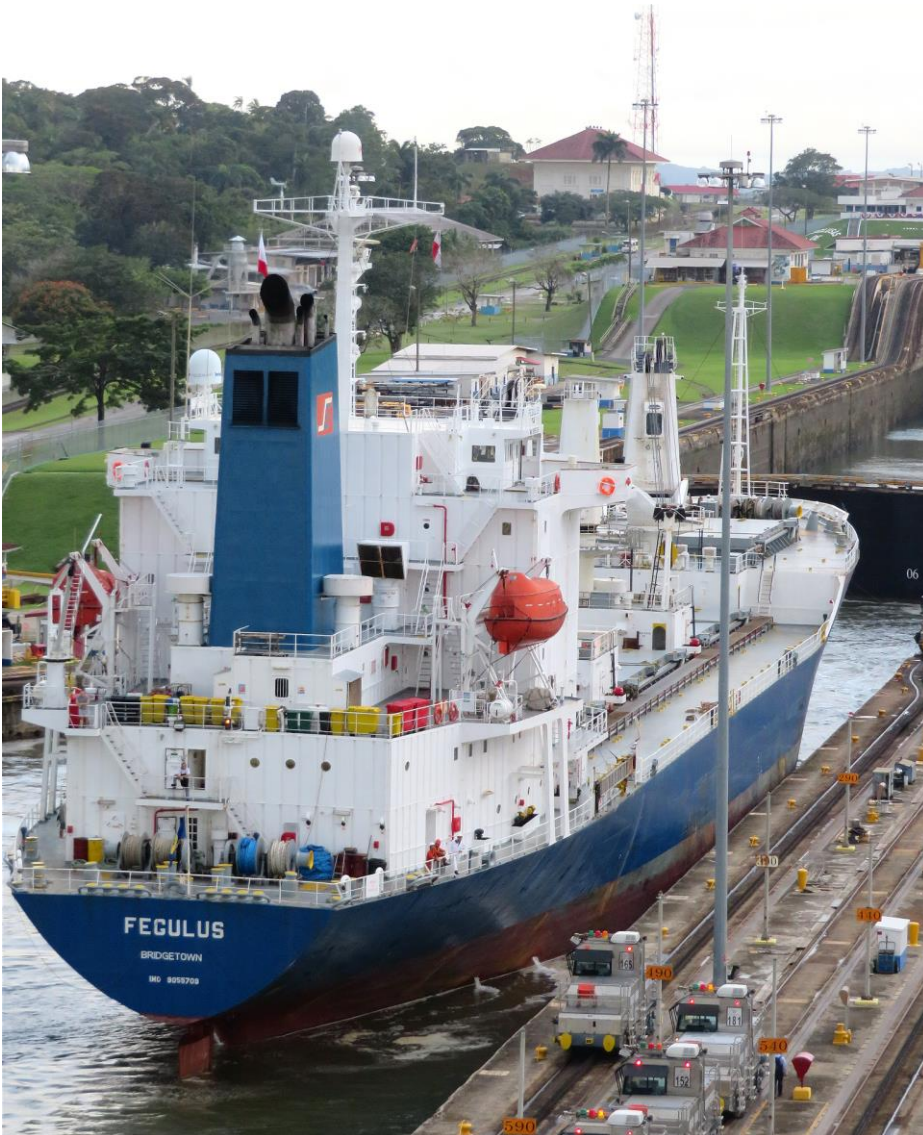
Named FEGULUS Panama Canal 26/11/2019