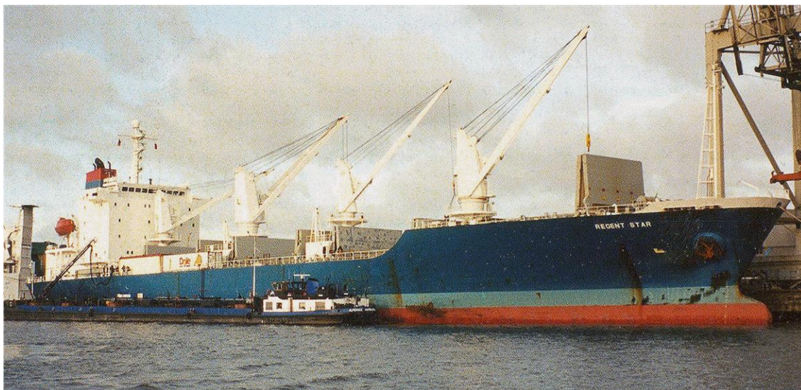
Named REGENT STAR Hamburg 2001