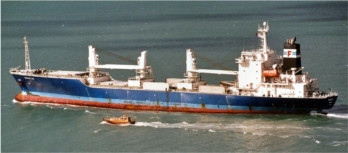
Named REGULUS Lyttelton (N.Z.) 14/4/2007