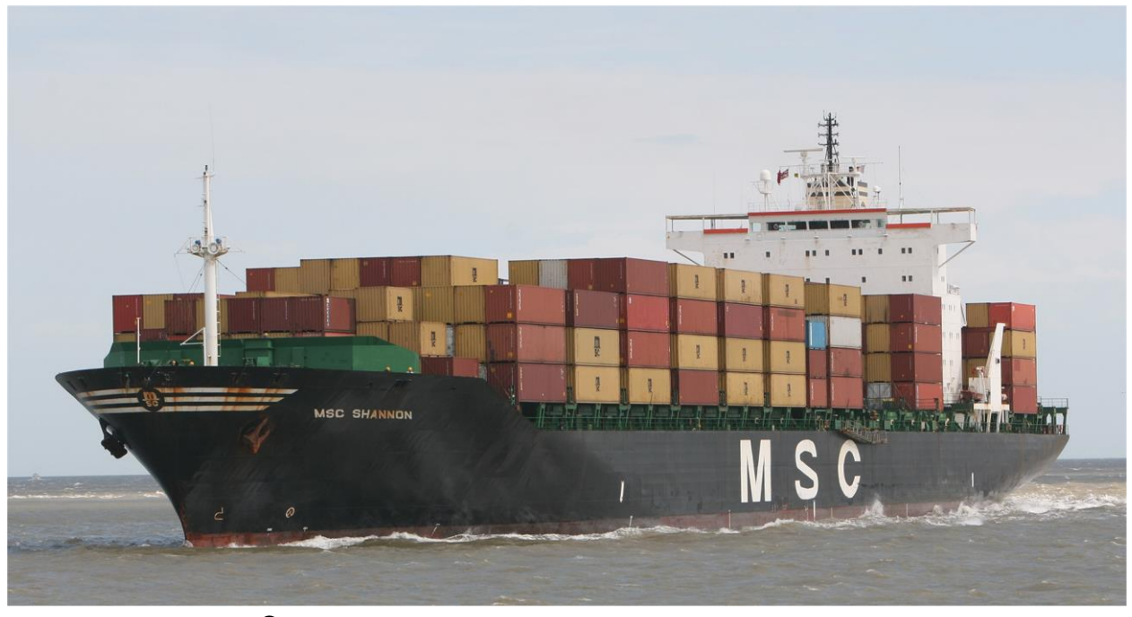
Felixstowe (UK) 28/8/2008