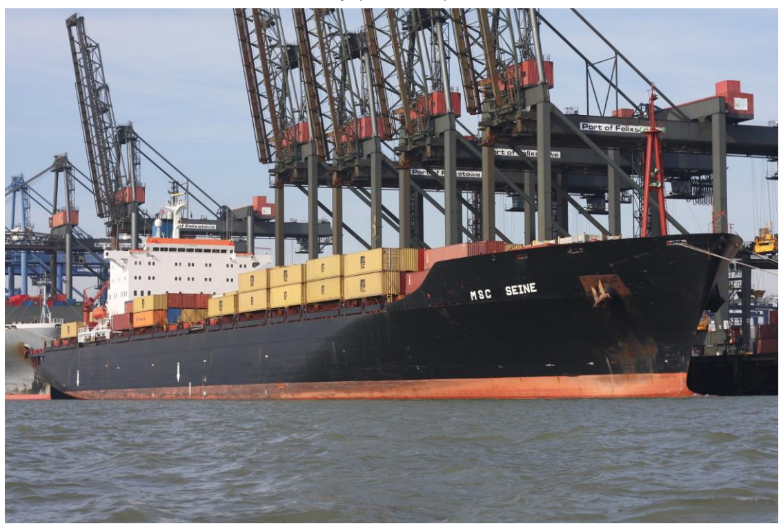
Felixstowe (UK) 11/19/2008