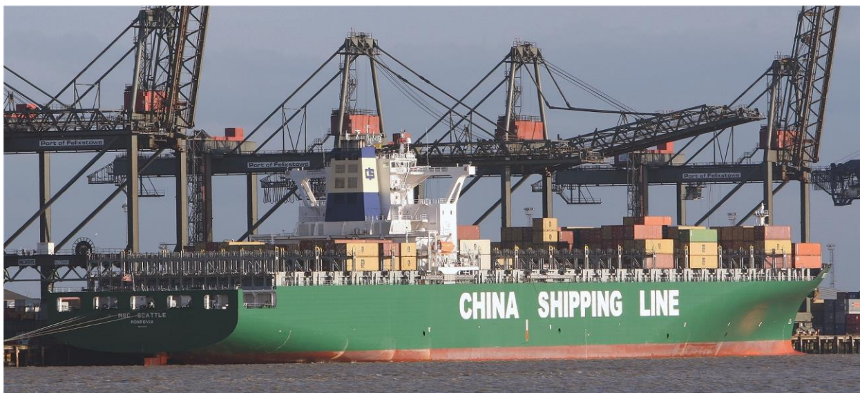
CSCL sublet to MSC from 2008-2010 Felixstowe (U.K.) 27/11/2008