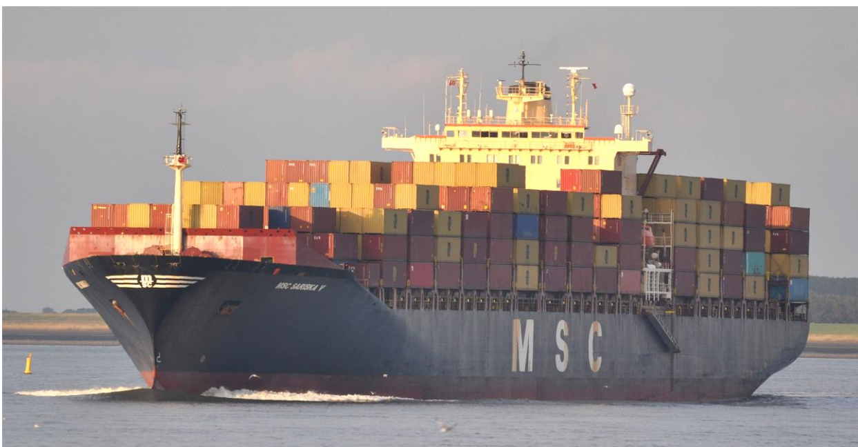
Named MSC SARISKA V Terneuzen 21/6/2024