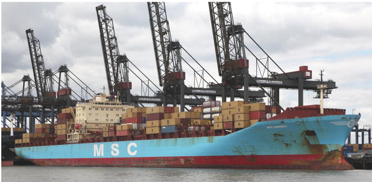
Felixstowe (U.K.) 22/7/2011