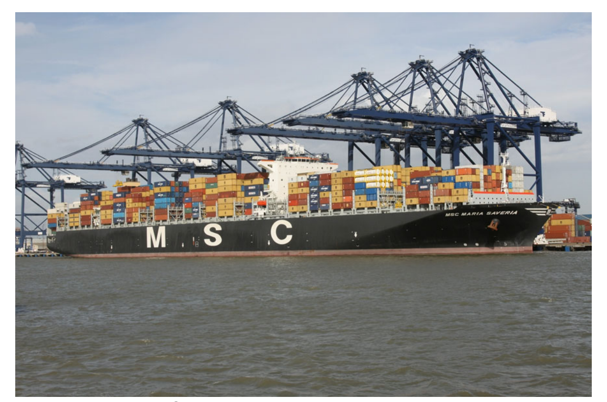
Felixstowe (U.K.) 17/10/2012