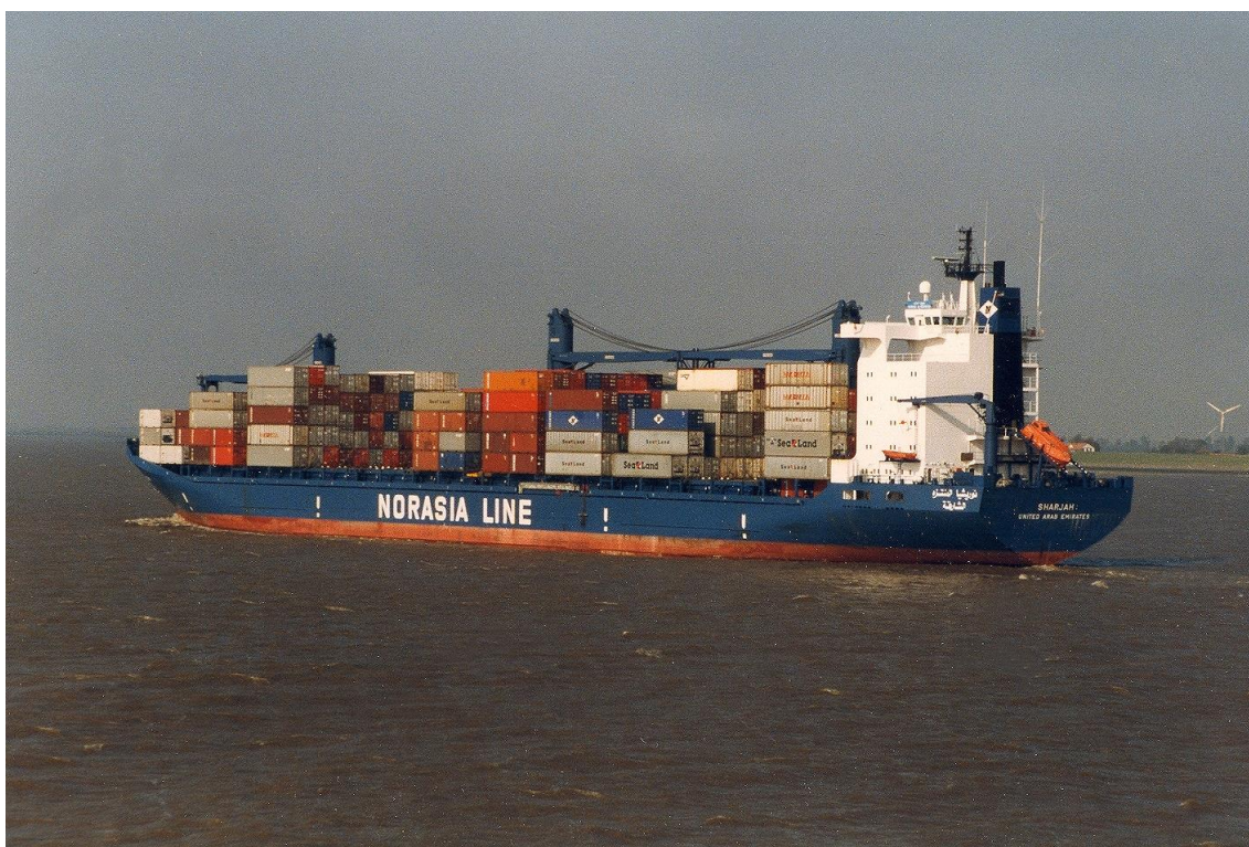
River Elbe 1/10/1993