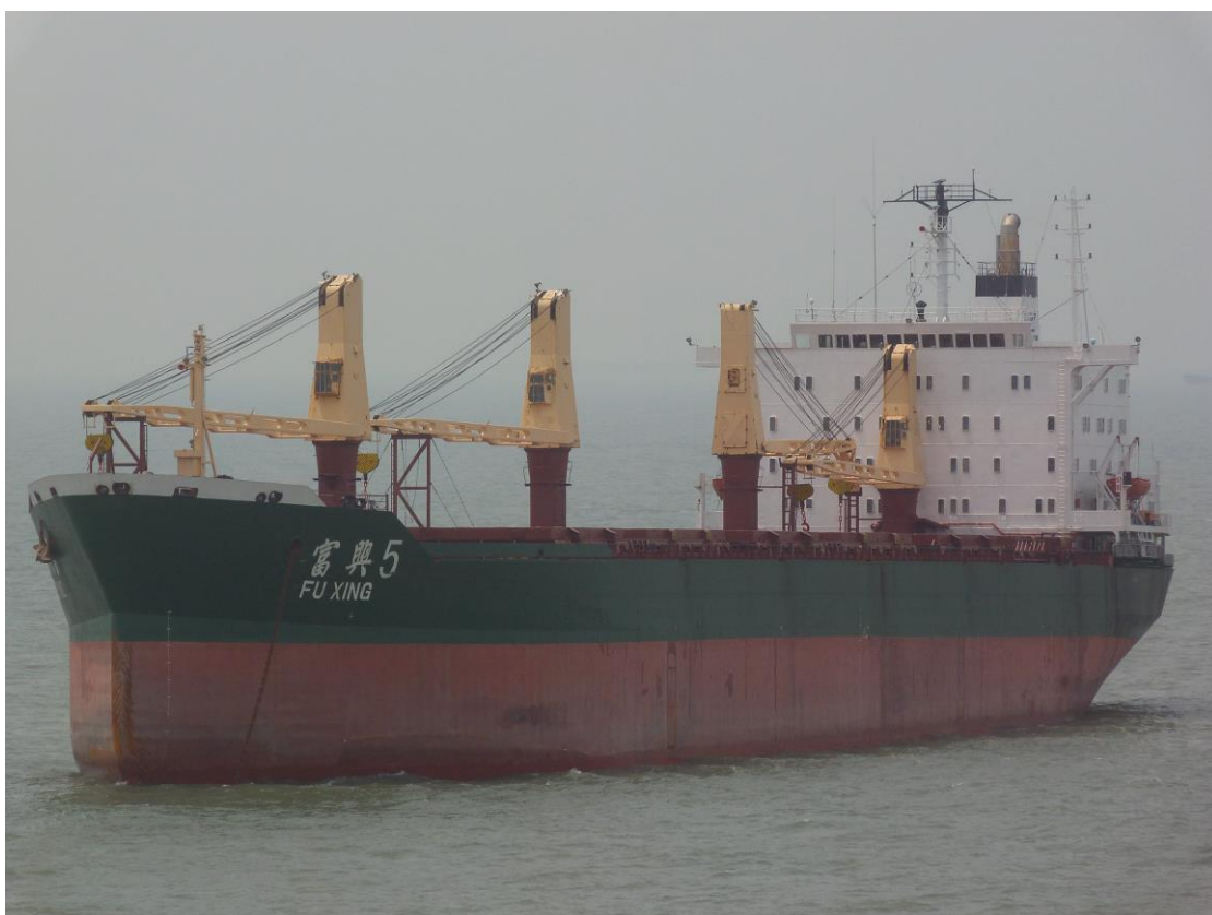
as FU XING 5 Tianjin 18/7/2011