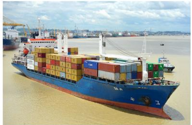
above: the 'UCC 14' vessel DA JI, originally the WATERSTOKER, upon departure from Chittagong. The type name reflected the ships' deadweight capacity of around 14,000 dwt.

The SAI SUNRISE was originally built as the WATERGIDS for Dutch owner and liner operator Joon Shipping, which operated several ships of this type on transatlantic services. After the company went bankrupt in 1991, the WATERGIDS and her sister vessels in the Joon fleet were