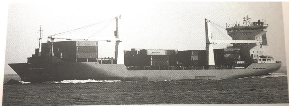
HELLEN SIF as TRSL TENACIOUS outward bound in the Scheldt on her maiden voyage, 24/10/95

Denmark: HELENE SIF, 14,665/95—m.container carrier has been completed as TRSL TENACIOUS.