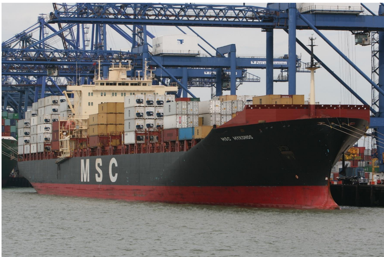
Named MSC MYKONOS Felixstowe (UK) 1/7/2010

2017: Sold to cash buyers and renamed MYKONOS for demolition in Alang 21/9/2017.