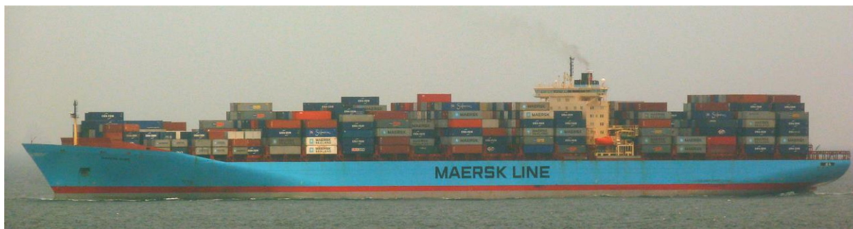
Korea Strait 28/7/2011

2007: Sold to Costamare Shipping Co SA, Greece.