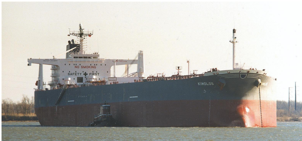
Delaware River 2/3/1999

2003: Sold to clients of Novoship (Sovcomflot), Russia. Renamed KUZBASS.