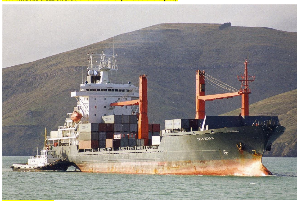
Named CHILE STAR II Lyttelton (N.Z.) 25/6/1999

1998: Renamed CHILE STAR II (new charter name / previous charter expired).