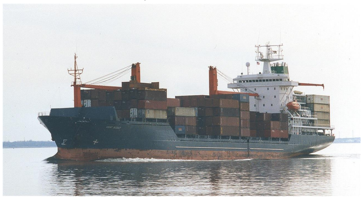
Delaware River 2/2/1998

1997: Renamed KENT SCOUT (charter name).