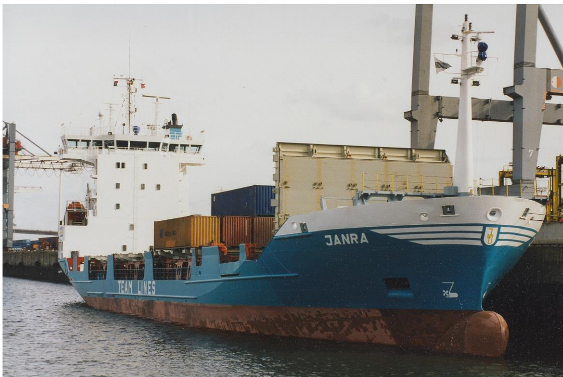
Hamburg 1/9/1998 © S. Wiedner