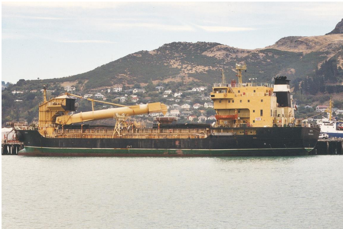
Lyttelton (N.Z.) 23/3/2003